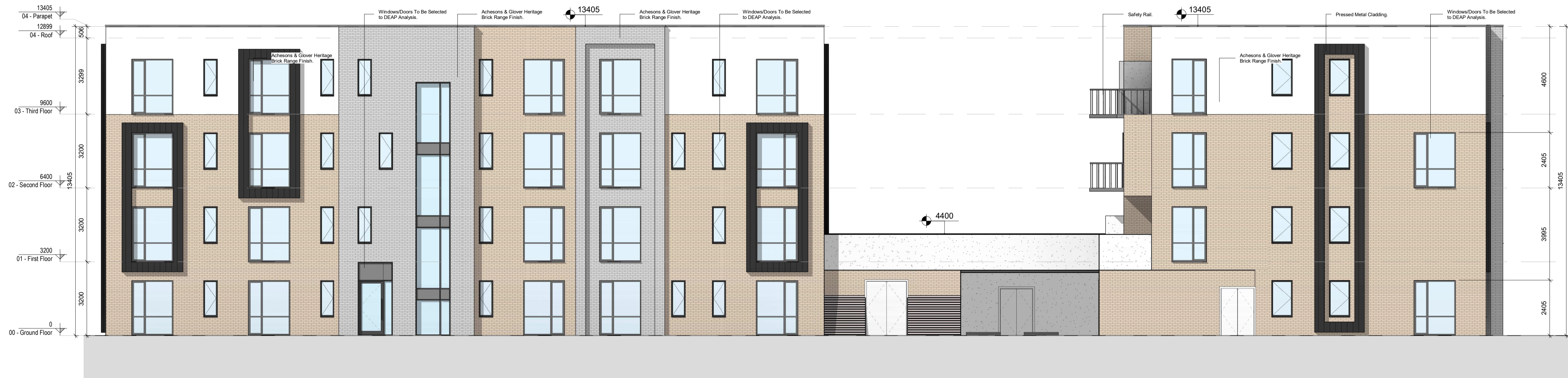
1 Perimeter Elevation 3 1 : 100