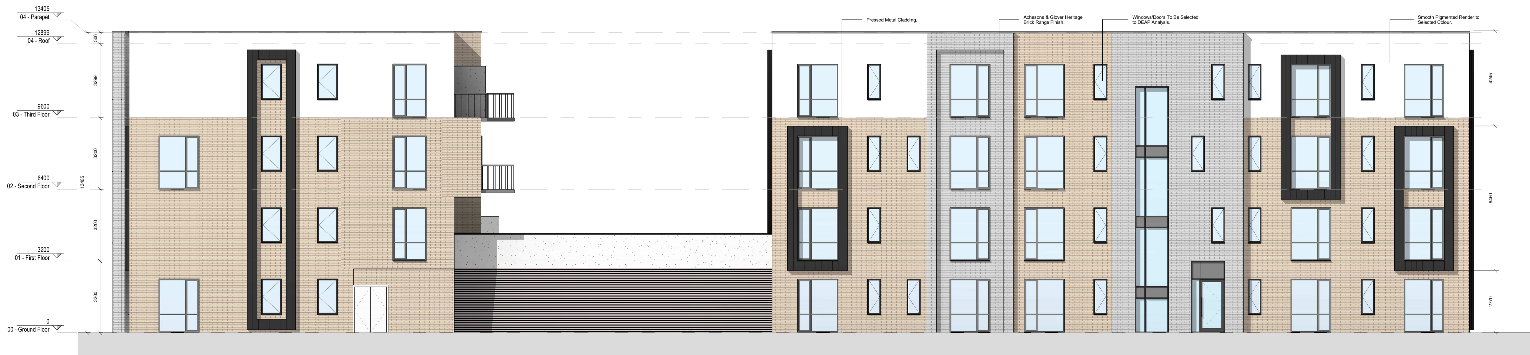
2 Perimeter Elevation 4 1 : 100